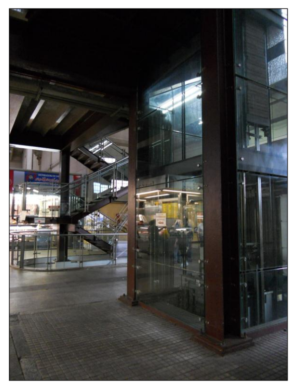
Image 5: Elevators and staircases lead to the mezzanine floor