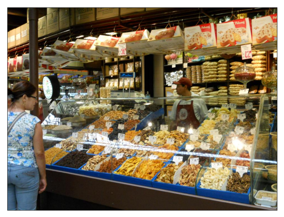
Image 12: Merchandise exposed in more hygienic containers

As can be seen, the structure of the market was maintained. The columns and stained glass, for example, maintains its original features preserved. As stated previously by Vieira, one can view the "air of modernity" that the market acquired with the reform. The shopping cubicles are more modern and hygienic. The goods that were previously exposed on stands and bags are now exposed in refrigerated containers with acrylic covers, being exposed in a real showcase: