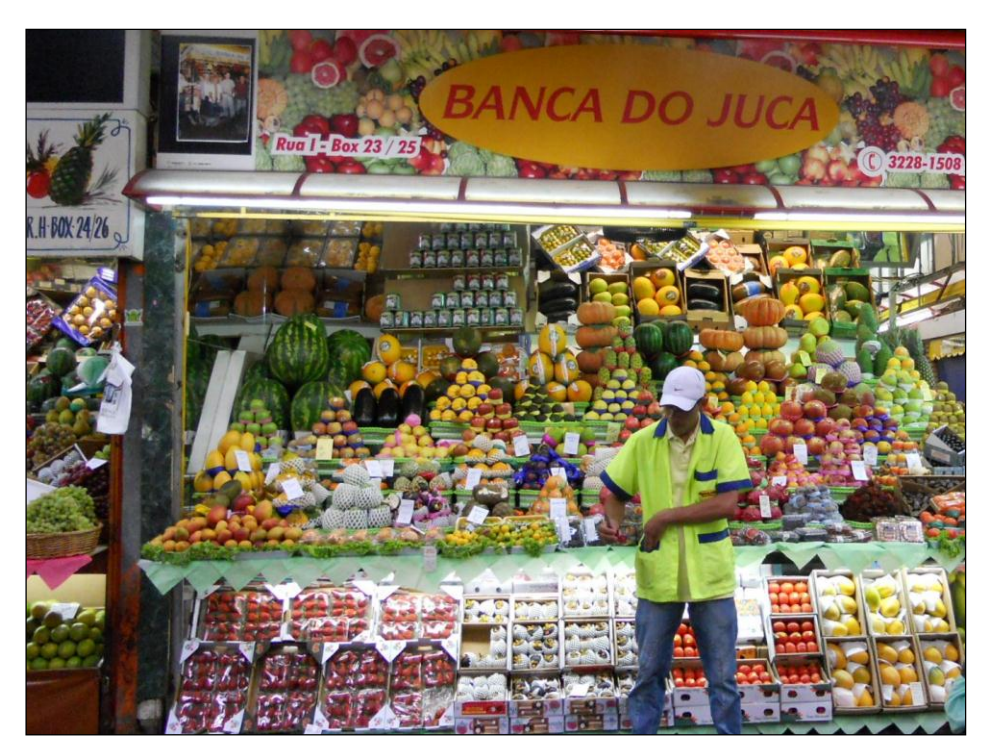
Image 14: Fruits, from the most common to the exotic

Customer service was also a discussion point. Most consumers praised the service. For them the "distinguished service" - making reference to the mediation of the vendor: product-vendor-consumer - is a unique feature of the market.