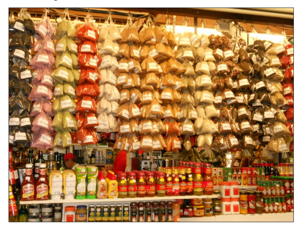
Image 13: Seasonings and specialty items

The vast majority of consumers surveyed - between Sao Paulo citizens and tourists - when asked why they buy in the market, the answer was clear: "Because there are products that can only be found here". Some added because the goods they buy are fresh and of good quality. The following photographs illustrate some of the goods to which customers referred.