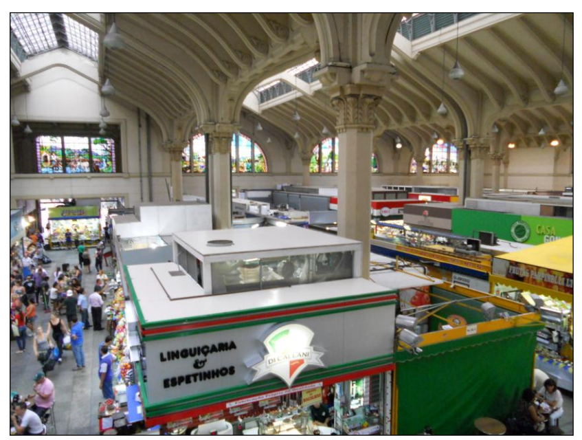
Image 6: View of the mezzanine floor