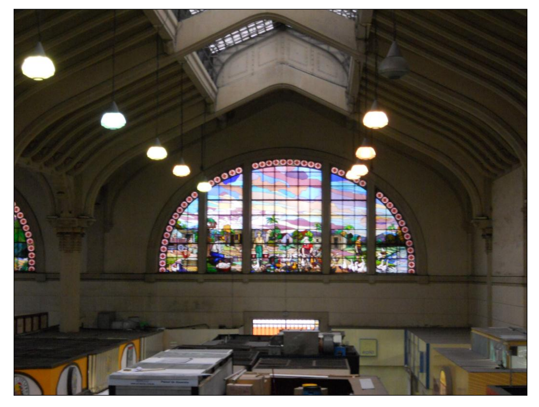
Image 1: Stained glass murals by Conrado Sorgenicht Filho

spaces), it was stated that the Market changed its function. As stated before, the Market was created with the purpose of guaranteeing the supply of goods and edibles of the population of São Paulo. Today, the market is veered towards tourism. According to the administration, tourism is the principal function of the market in actuality, and in this way, the price of goods is priced for tourists. It is noteworthy that the geographical area is the main commodity of tourism. It is precisely this new centrality denouncing the consumption of the space, i.e., the Market's strong role as a tourist attraction today; its space is also a commodity.